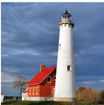
Tawas Point Lighthouse