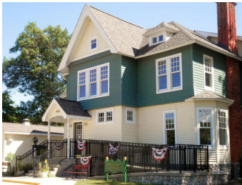
Iosco Co. Historical Museum

It is not only flowers that open in the spring, but so do some of our favorite attractions.