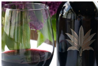
Cozy Restaurants to Fine Dining