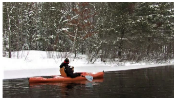
Winter kayaking on the Au Sable River