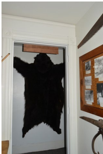
Iosco Co. Historical Museum