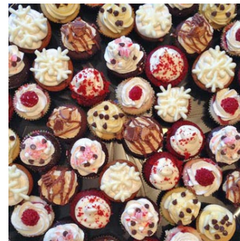
Shopping for treats, sports equipment, or anything you might need or want

Tawas Bay offers it all for everyone! Visit Tawas Bay as winter hangs on.