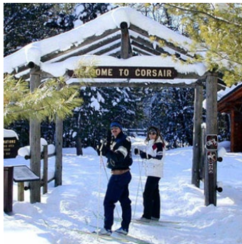
Corsair x-country ski